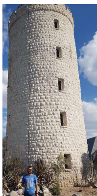
Okaukuejo's observation tower

The Etosha National Park is a must-to-see when visiting Namibia. Sitting at a waterhole at the Ukaukuejo Rest Camp will guarantee views of many antelope, elephant and perhaps a few predators as well.