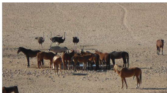
Wild horses of the Namib