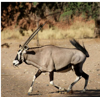
Oryx in full flight

En route you'll see how desert sand negatively affect an operational railway line. We overnight in a B&B in this coastal (& windy) town. Dinner is available in town.