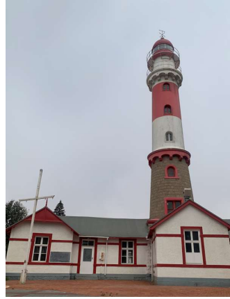
Lighthouse in Swakopmund

Tonight we'll dine at another interesting German restaurant.