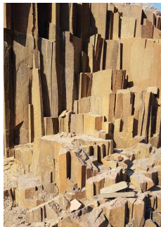
Nature's Organ pipes

Today you can view the natural 'organ pipes', the Damara live Culture Museum, a petrified forest and view the Brandberg from a distance. Travel through the town of Khorixas and view 'the Finger of God' rock formation (time permitting).