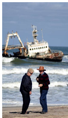
Stranded ship close to shore

Places like Wlotzkasbaken and Henties Bay will be visited before arriving in the old mining town of Uis. We'll overnight close to the Brandberg and experience a magnificent sun setting. Dinner at this venue is included in the tour package.