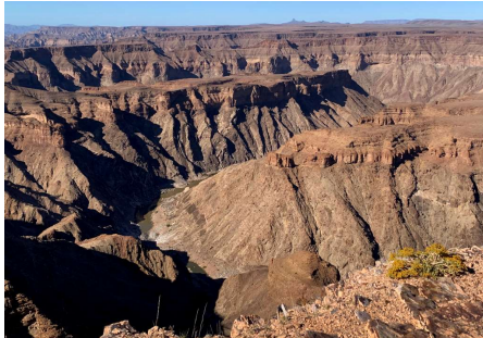
Fish River Canyon on a clear morning

We overnight in a lodge close to Keetmanshoop. Dinner is available at the venue.