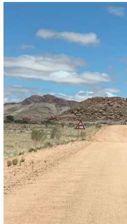
Gravel road in Namibia

A visit to the famous Dune 7 is on the cards as well. There is a standing challenge for a case of beers – ask us about it.