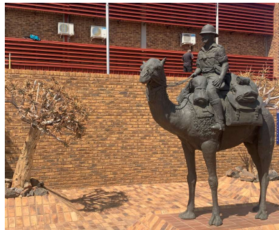
Upington's SAPS Camel

Book in, enjoy dinner and stay overnight in the Upington Inn. This is a long day on tour in terms of km travelled. The longest day on this trip.