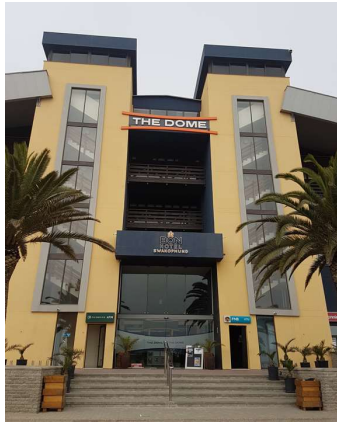
The Dome Indoor Sport Centre