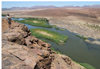
Orange River at Aussenkehr