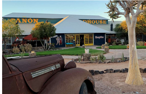
Canon Road House